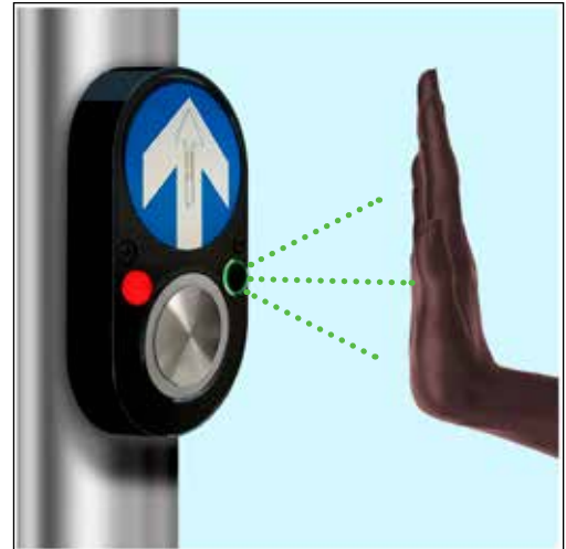
Sensor Activation between 3 – 12cm

The iTouch Sensor has been successfully tested to a 10,000,000 activation rate.