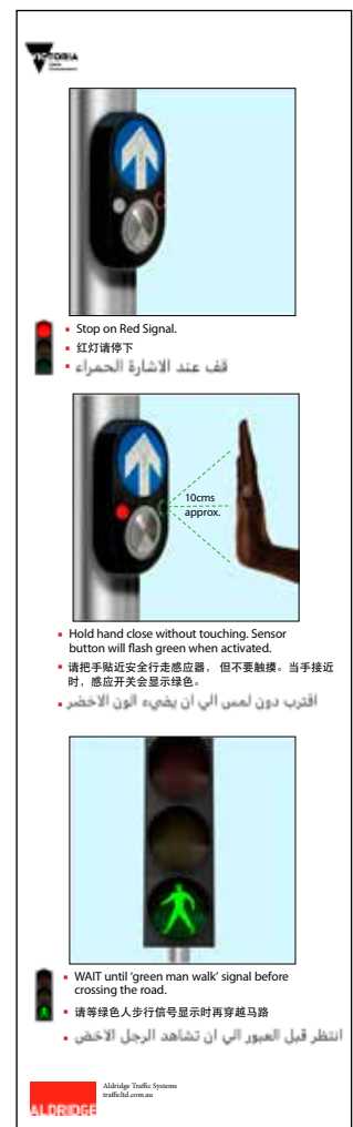
Above Pole Instruction Sticker – available in multiple languages

Aldridge offer a self-adhesive sticker for the mounting pole. This features crossing instructions in multiple language translations, to suit your particular requirements. Your road authority logo can be printed on the sticker as shown.