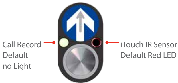
iTouch Contactless Sensor with Call Record in Default State