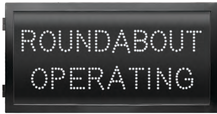
Roundabout Operating Special Order 1100 x 490