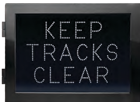
Keep Tracks Clear 1000 x 600