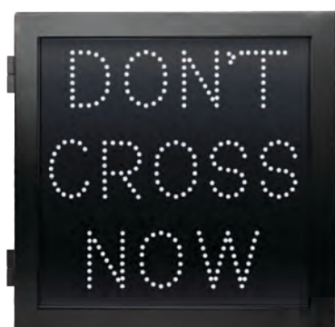
Don't Cross Now 545 x 545