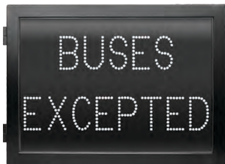
Buses Excepted 1000 x 600