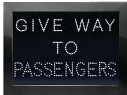
Give Way To Passengers 1000 x 600