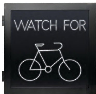
Watch For Bicycles 545 x 545