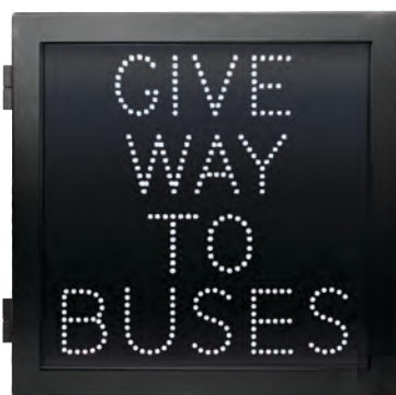
Give Way To Buses 545 x 545