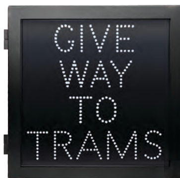
Give Way To Trams 545 x 545