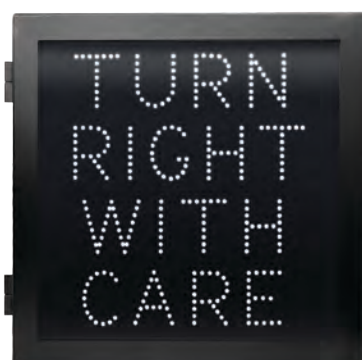
Turn Right With Care 545 x 545