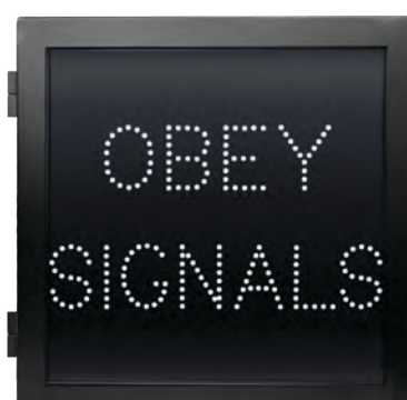
Obey Signals 545 x 545