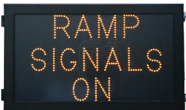
3 Part Changeable Message Sign No Entry Ramp Signals On Freeway Closed Special Order