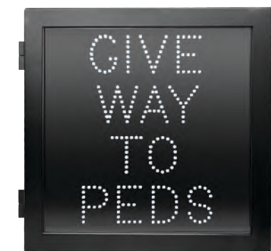
Give Way To Pedestrians 545 x 545

The following signs are just a snapshot on offer. The EMS can be made to special order and sizes. Contact our sales team to discuss your specific message requirements.