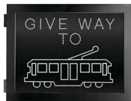
Give Way To Trams 810 x 710