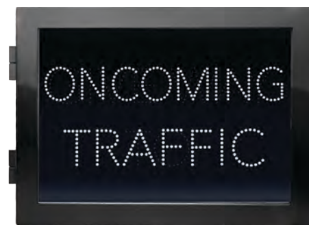
Flash - Give Way To Oncoming Traffic 1000 x 600