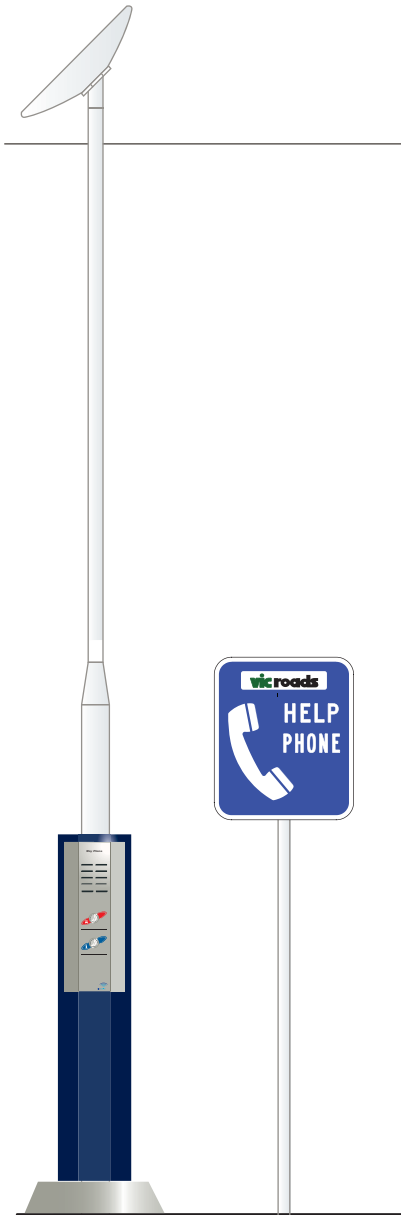
1375mm pedestal with 4m external solar pole