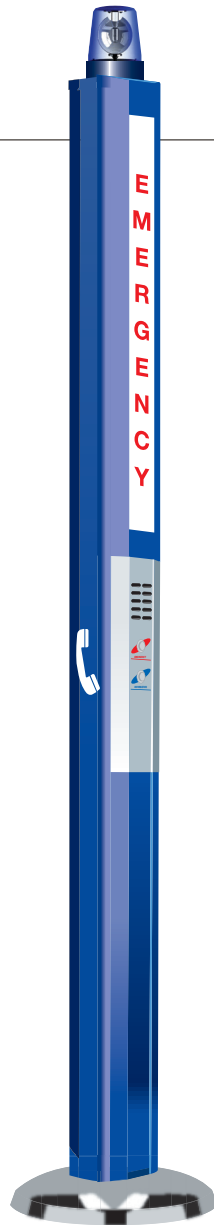
2280mm pedestal with lightbox illumination and strobe