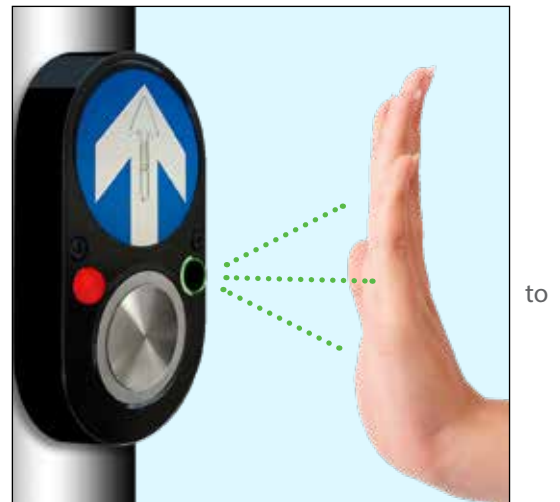
Sensor Activation between 3 – 12cm

The standard push button control requires pedestrians to push the button at traffic signal intersections inform the traffic signals they are waiting to cross the road. With the iTouch physical touch is no longer necessary.